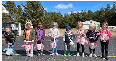
A beautiful day for our egg hunt.