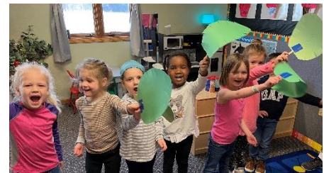
Yelling "Hosana" for Palm

In the month of April, 3K spent a majority of time learning about the events of Holy Week along with enjoying some spring weather. We talked about why we call that sad day Good Friday and we rejoiced with singing and dancing as we celebrated Easter. If the weather allows, during the month of May, we will be spending more time outside. We're hoping to utilize our outdoor classroom, and take nature walks on the trails throughout the woods. As our school year is winding down, it's fun to reflect on all the growth of the children in such a small amount of time. They have grown in their motor skills, social skills, and academic skills. Most important, is the children's growth in their faith and knowledge of God's love for them.