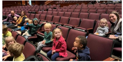
3K students at the PAC getting ready to watch the play.

Some of our special days in October included a field trip to the PAC for the play Don't Let the Pigeon Drive the Bus, picture day, and our fall party. In the month of November, we are looking forward to learning more about farms and celebrating Thanksgiving.