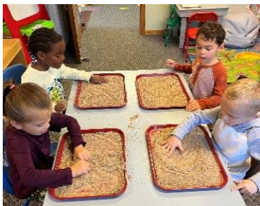
4K students practicing writing letters in the sand.